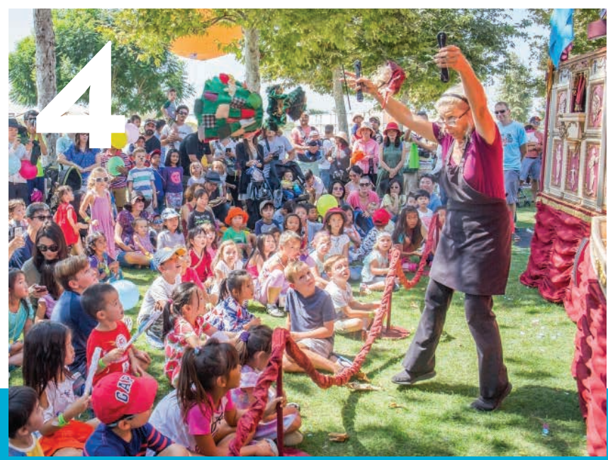
CHILDREN'S SHOW AT IRVINE GLOBAL VILLAGE FESTIVAL